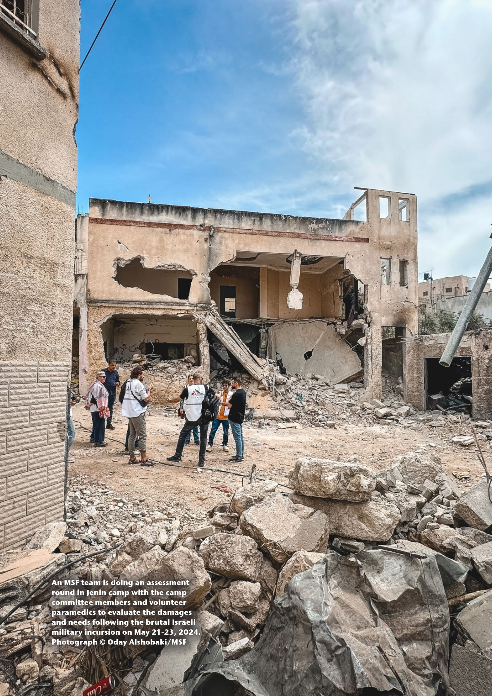
An MSF team is doing an assessment round in Jenin camp with the camp committee members and volunteer paramedics to evaluate the damages and needs following the brutal Israeli military incursion on May 21-23, 2024.