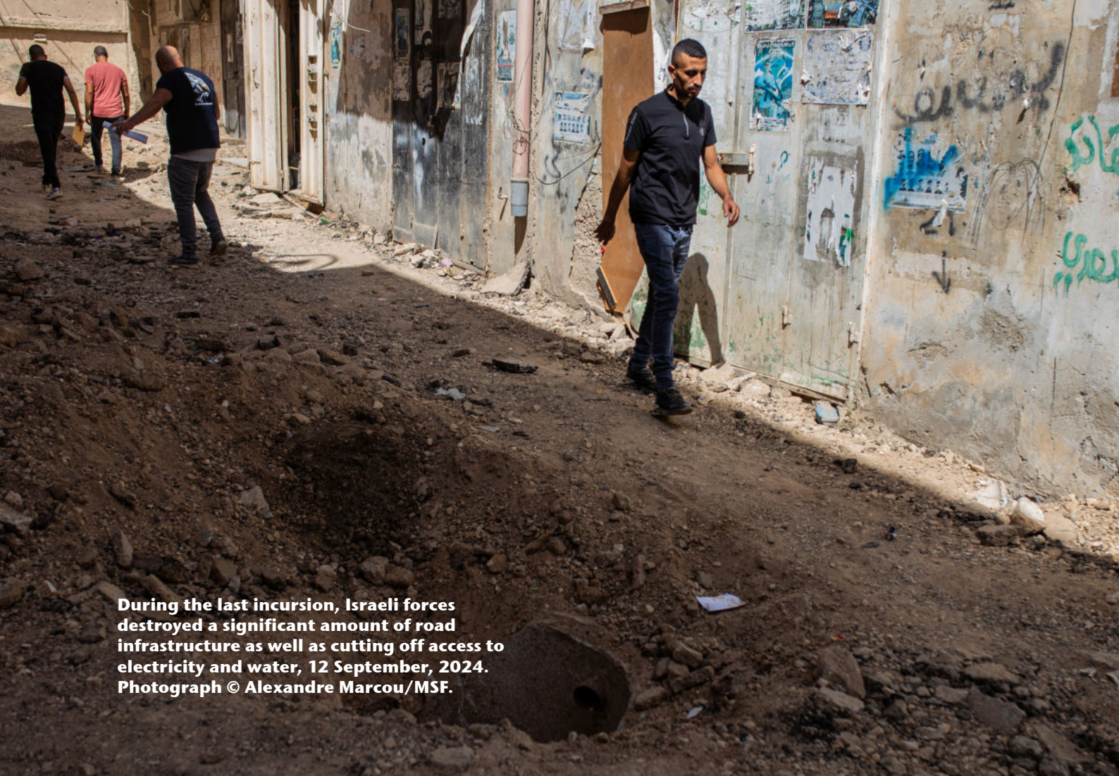
During the last incursion, Israeli forces destroyed a significant amount of road infrastructure as well as cutting off access to electricity and water, 12 September, 2024.