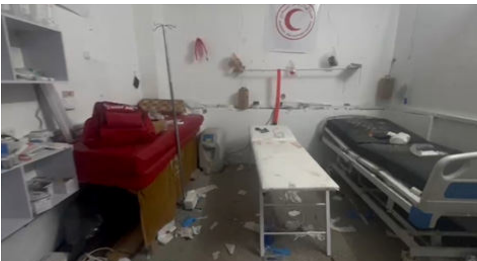
Damage done to the stabilisation point in Nur Shams camp, Tulkarem, following an Israeli incursion on 16-17 December 2023.