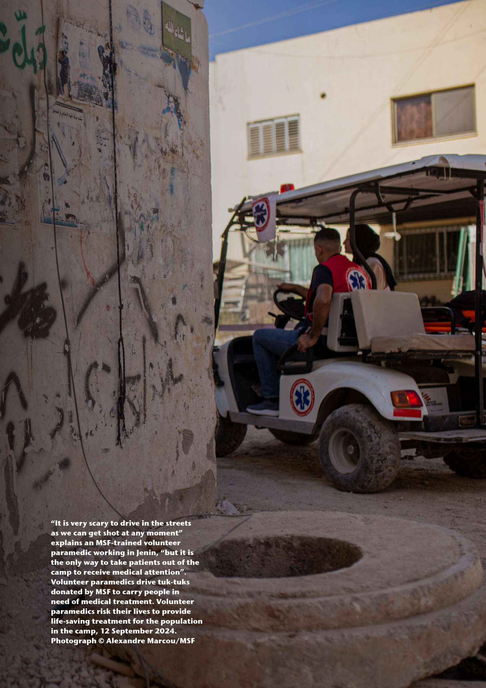
“It is very scary to drive in the streets as we can get shot at any moment” explains an MSF-trained volunteer paramedic working in Jenin, “but it is the only way to take patients out of the camp to receive medical attention”. Volunteer paramedics drive tuk-tuks donated by MSF to carry people in need of medical treatment. Volunteer paramedics risk their lives to provide life-saving treatment for the population in the camp, 12 September 2024.